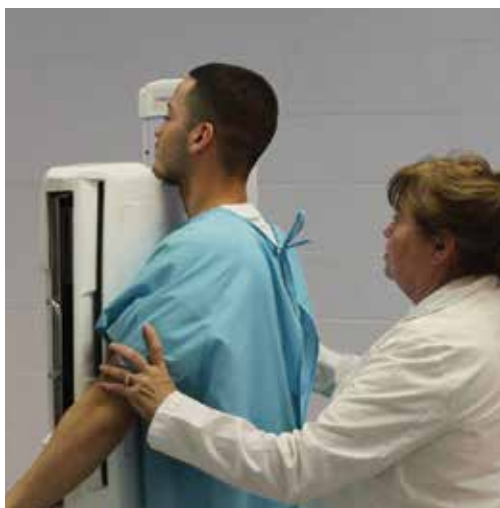
The US FDA says that the Chest X-ray is the most common medical imaging examination.