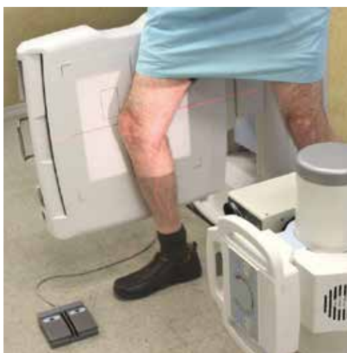
Knee injuries are common at all ages.