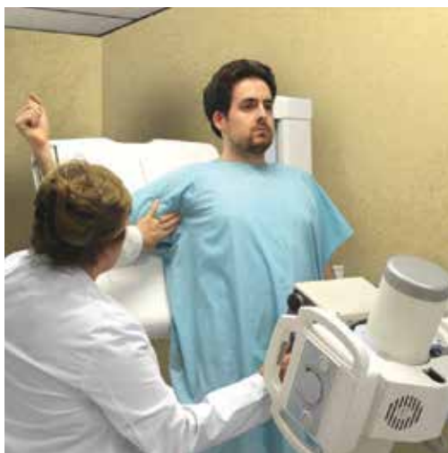
Your shoulders are the most movable joints in your body and having them work properly is important.