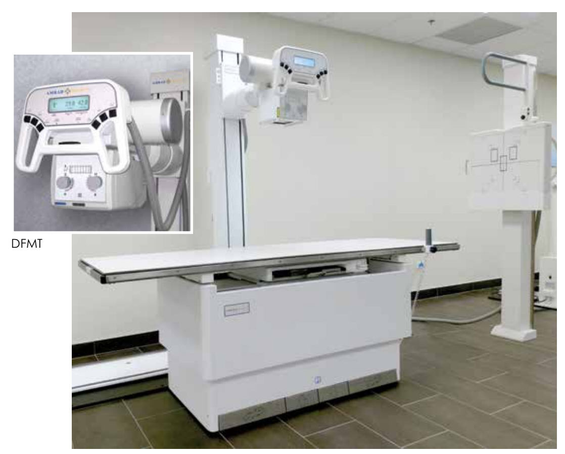
Fast and Accurate Patient Positioning