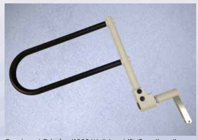
Overhead Grip for J1000 Wallstand (FMT, optional)