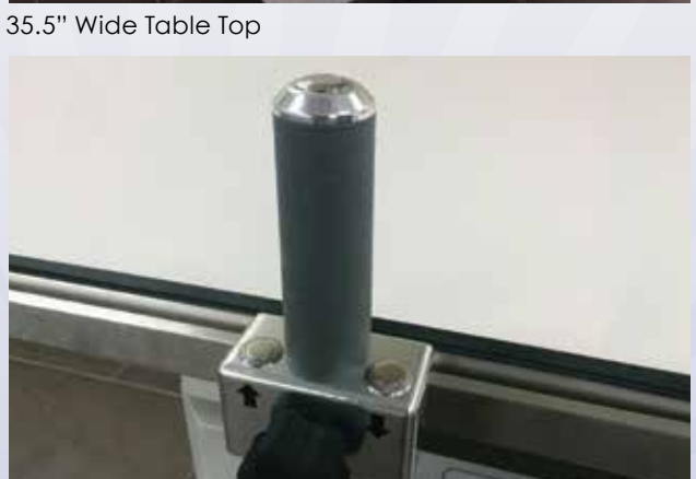
Table Lock Release Handle with Elevation (FMT, optional)