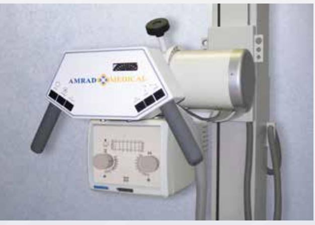
Economical Alternative FMT